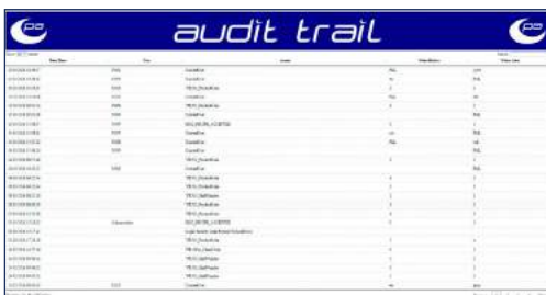
Access historic data such as operator changes to settings.