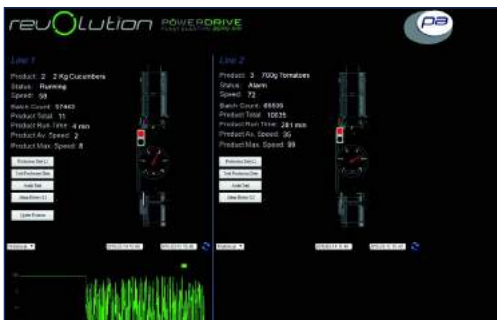
Mobile dashboards allow you to compare OEE stats across different products on each line.