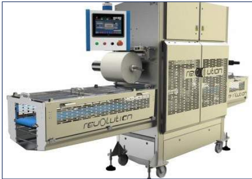
Single lane tray sealer 'Revolution' by Packaging Automation Ltd.